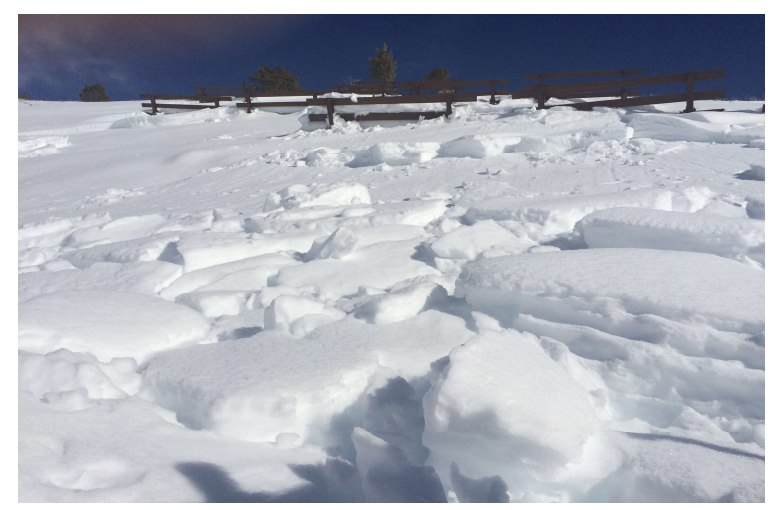
Fig. 6. Looking upwards from instrumented SSS towards fracture and crown of January 2015 slide at Milepost 151 site.