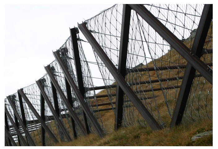
Fig. 3. Semi-rigid snow supporting structure at Val Thorens Ski Resort, France.