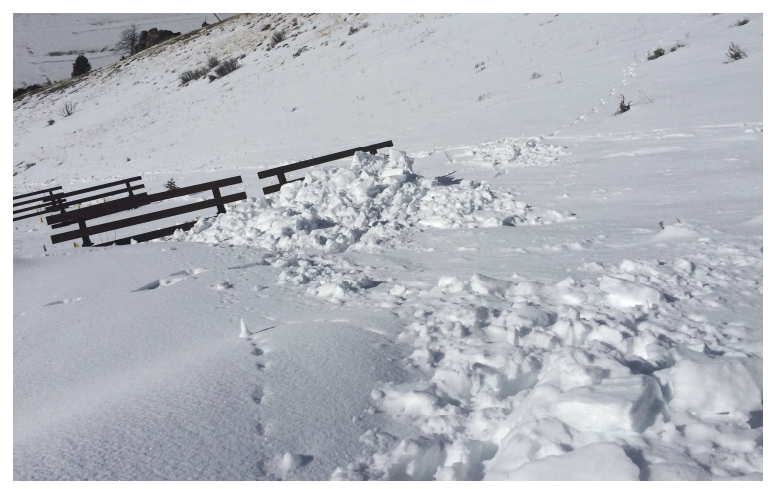
Fig. 5. Avalanche debris resting on SSS at the Milepost 151 Avalanche site.