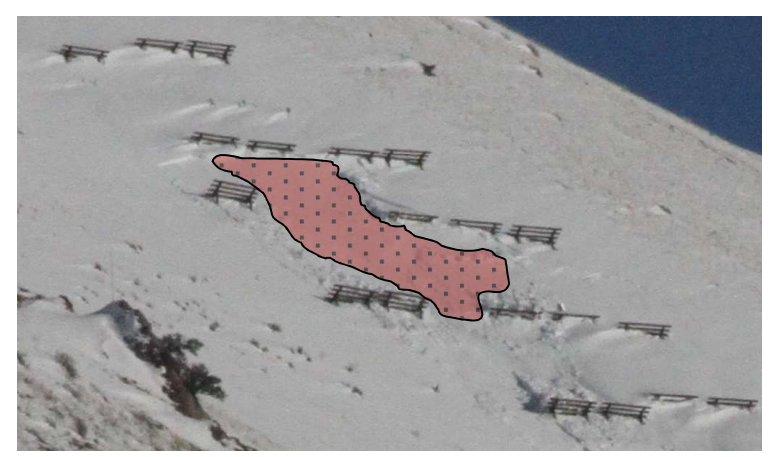
Fig. 4. Extents of small avalanche in upper reaches of the Milepost 151 site, January 2015.

foundation that would require significant repair can be avoided and yielded fuse elements can be replaced during summer seasons with simple hand tools.