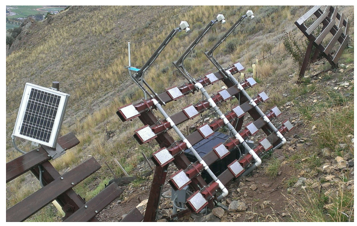
Fig 1. Milepost 151 snow supporting structure with monitoring instrumentation.